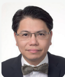
DR TONY TAN